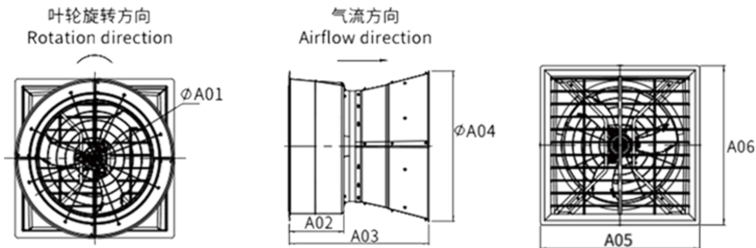
外形尺寸 Outline Dimension